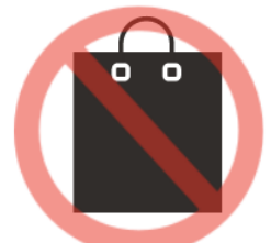
Large tote bag