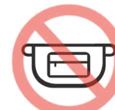
Large fanny pack