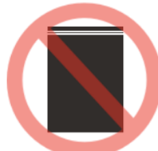
Colored plastic storage bag