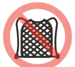
Mesh or straw bag