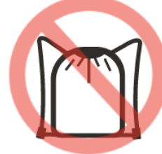
Solid color cinch bag