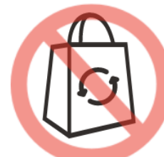
Reusable grocery tote