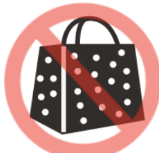
Printed patterned plastic bag